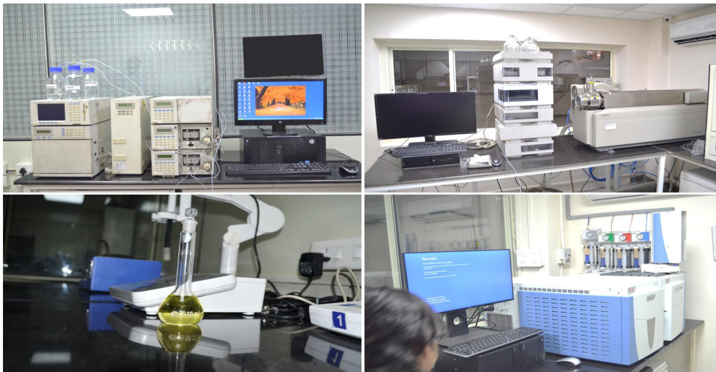
Fully Managed Modern Lab with all Equipment for Hands-on Training